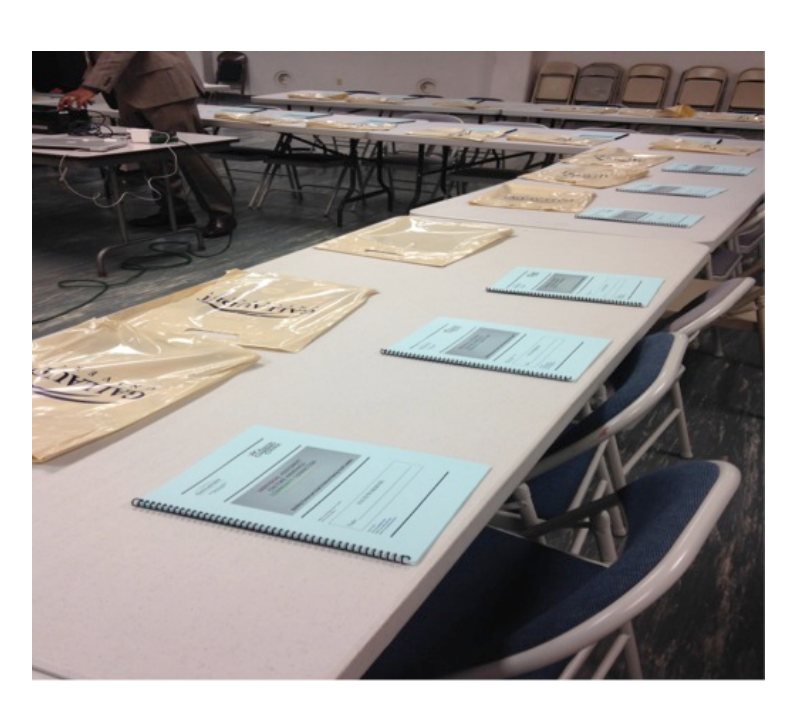
Youth Leadership Training: Arkansas School for the Deaf